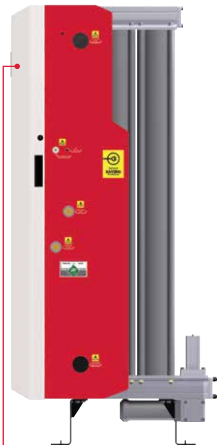
Integral Oxygen Analyser – Constant monitoring ensuring the correct gas purity.